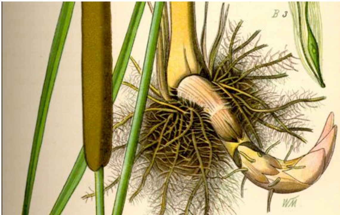
Figure 5 The rhizome of the cattail

preferred to graze in dry grasslands where the conservationists were trying to regrow a forest. These cattle proved ineffective in killing the cattails. 50