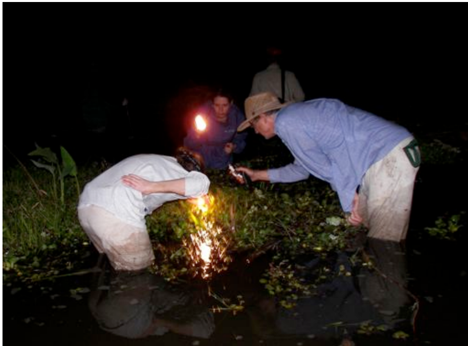
Figure 2 Test trials with foam frogs in the wetlands of Palo Verde National Park

After recording the frog calls with their shotgun microphone, and manufacturing a CD with digitally-altered, low-pitched calls, the graduate students think through semiotic theories as they trudge around the swamp with their boom box. Will foam frogs bluff by lowering their voice in response to simulated frog intruders? Mud sucks at their rubber boots and sneakers. They wade in water that reaches up over their knees. Water scorpions sting them. Leeches struggle to find a gap in their clothes. A distant pair of large glowing orbs, 'eye shine,' reflects the light from the students' headlamps and follows their movement around in the water. "This is frog one-oh-one," he says into the mic. "Frog one-oh-one. Recording frog one-oh-one. Day two of our test trials." She notes the temperature of the water and then plays a blast of digitally altered frog calls on the boom box. He stands still in the warm, dark, water with the shotgun mic pointed at frog 101.