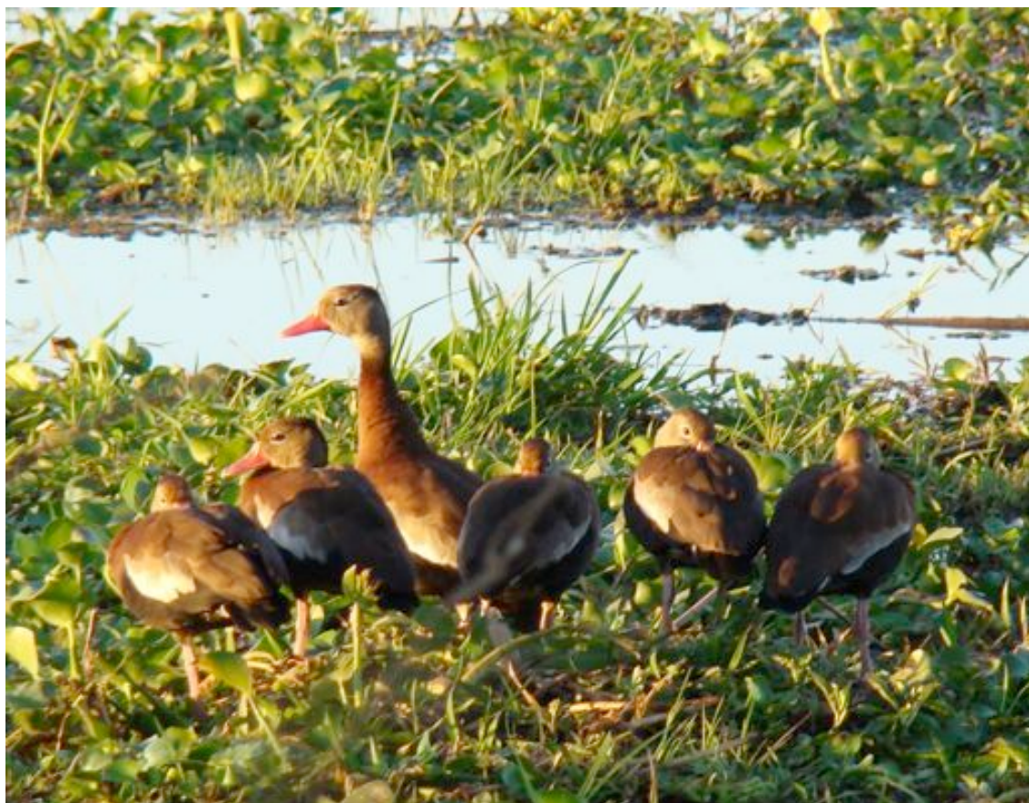
Figure 9 Black Bellied Whistling Ducks, or Piches , resting on a floating island of water hyacinth in Palo Verde National Park (Photograph: CIENTEC, available under a CC BY-NC-SA 2.0 license).

Costa Rican slang. A playful interaction with a Costa Rican biologist helped me understand subtle linguistic associations with this word. One day, as I was finishing lunch in the dining hall of Palo Verde Biological Station alongside other researchers and dozens of undergraduate students, she called out: “ Como se llama las hembras de los Piches? ” [What do you call the female Piches?] As I stood there looking dumbfounded, she continued: “ Como se llama las hembras de los gatos [cats]?” “ Gatas ” “ Como se llama las hembras de los perros [dogs]?” “ Perras. ” “ Entonces, como se llama las hembras de los Piches? ” “ Pichas! [Costa Rican slang for “Penises!”] The room exploded into laughter as I trundled into the wetlands in a pair of rubber boots while hefting a borrowed pair of binoculars to watch ducks.