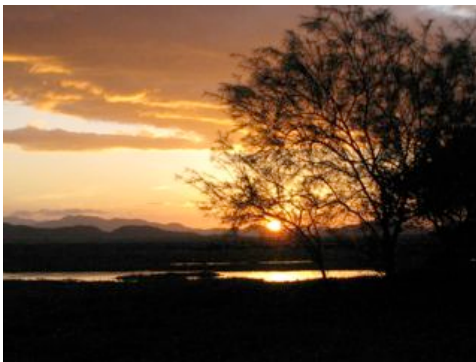
Figure 3 Palo Verde National Park pictured at sunset