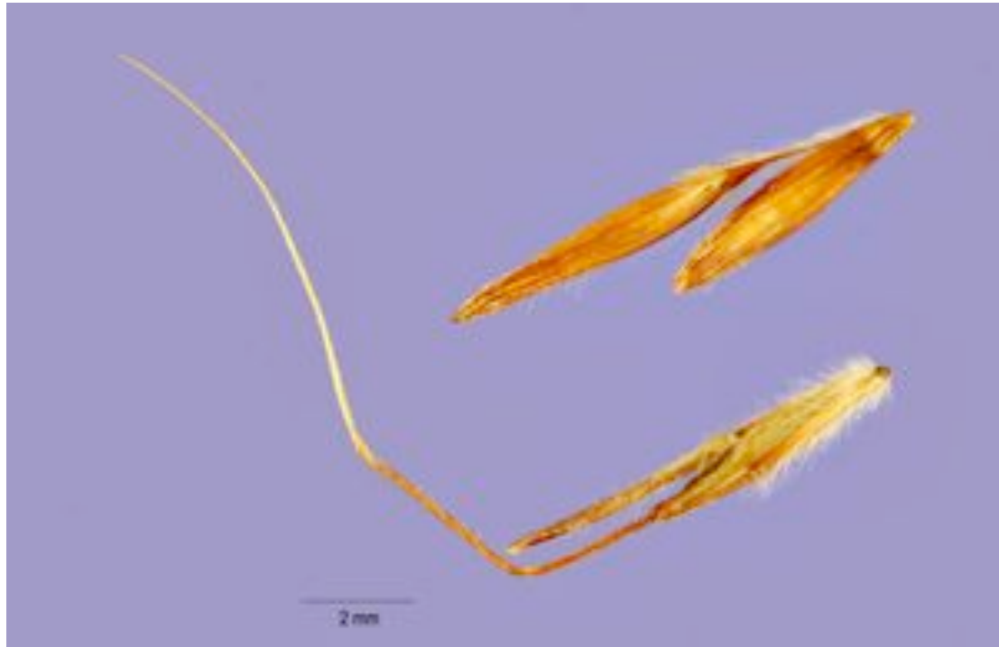
Figure 4 Seeds of Jaragua grass

humans helped Jaragua regenerate in their fields and facilitated its spread, like a rhizome, into the surrounding forest.