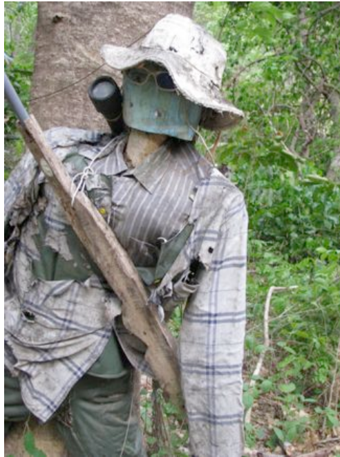
Figure 10 Duck hunting, the world making game of powerful foreigners, is illegal in Costa Rica. Some farmers of Bagatzí have become poachers, intruding onto the government nature preserve in Palo Verde managed by conservation biologists. This mannequin with a wooden ‘gun’ was installed by park guards on one of the dirt roads crisscrossing the national park. Guards made mimetic copies of themselves, aiming to startle intruders with uncanny specters

sprouts are the favourite food of piches . When I arrived at his house late one night Gerardo was bustling in his back room—he had just taken a quick shower and was collecting his things. He wore a floppy round hat, a long sleeved shirt, and thick brown pants. Grey stubble was sprouting from his sun-baked brown skin.