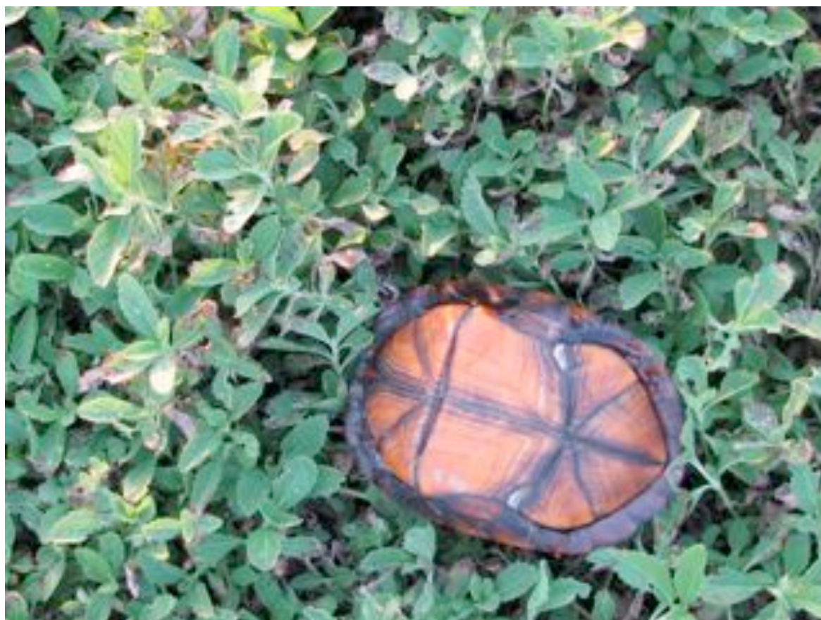
Figure 15 A turtle hiding in its shell near a fanguero tractor rolling through the wetlands of Palo Verde National Park

The speech prosthetics of these graduate students were fragile. They only sampled six sites in open water, and five sites in cattail stands. Senior scientists in residence at Palo Verde Biological Station never conducted a follow up study with larger sample sizes to track the populations of these organisms through time. Instead of trying to create a democratic assembly, a unified Parliament of Things where all creatures of the wetlands might one day be represented, the park officials were being moved by oblique powers. Amidst competing visions of conservation and agricultural production, shifts in these oblique powers were determining who lived and died. “The perspective of the Parliament of Things belongs to a utopia,” in the words of Isabelle Stengers. “It is nothing more than an empty dream if it does not function as a diagnostic vector for what makes it a mere utopia, as a learning ground for resisting what today opportunistically frames our world.” 86