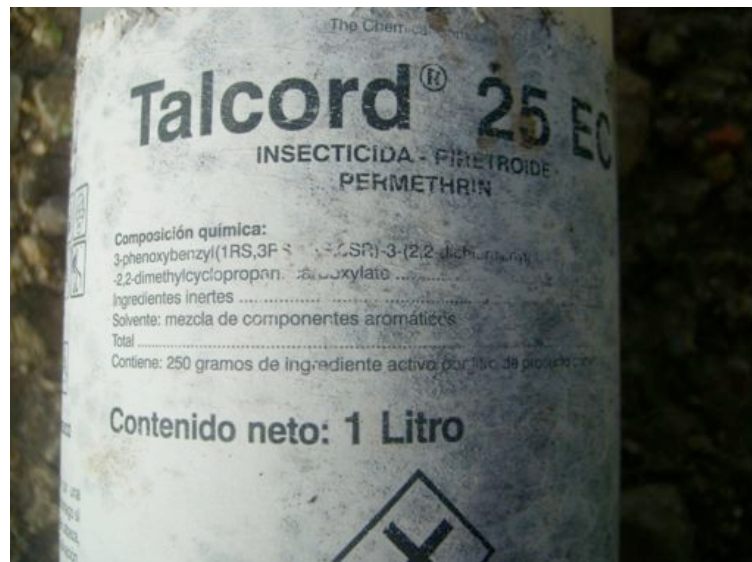
Figure 12